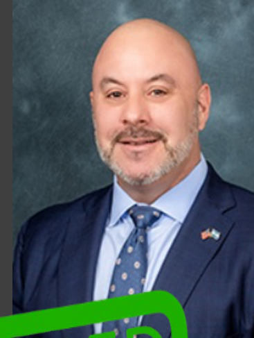
Senator Blais Ingolia