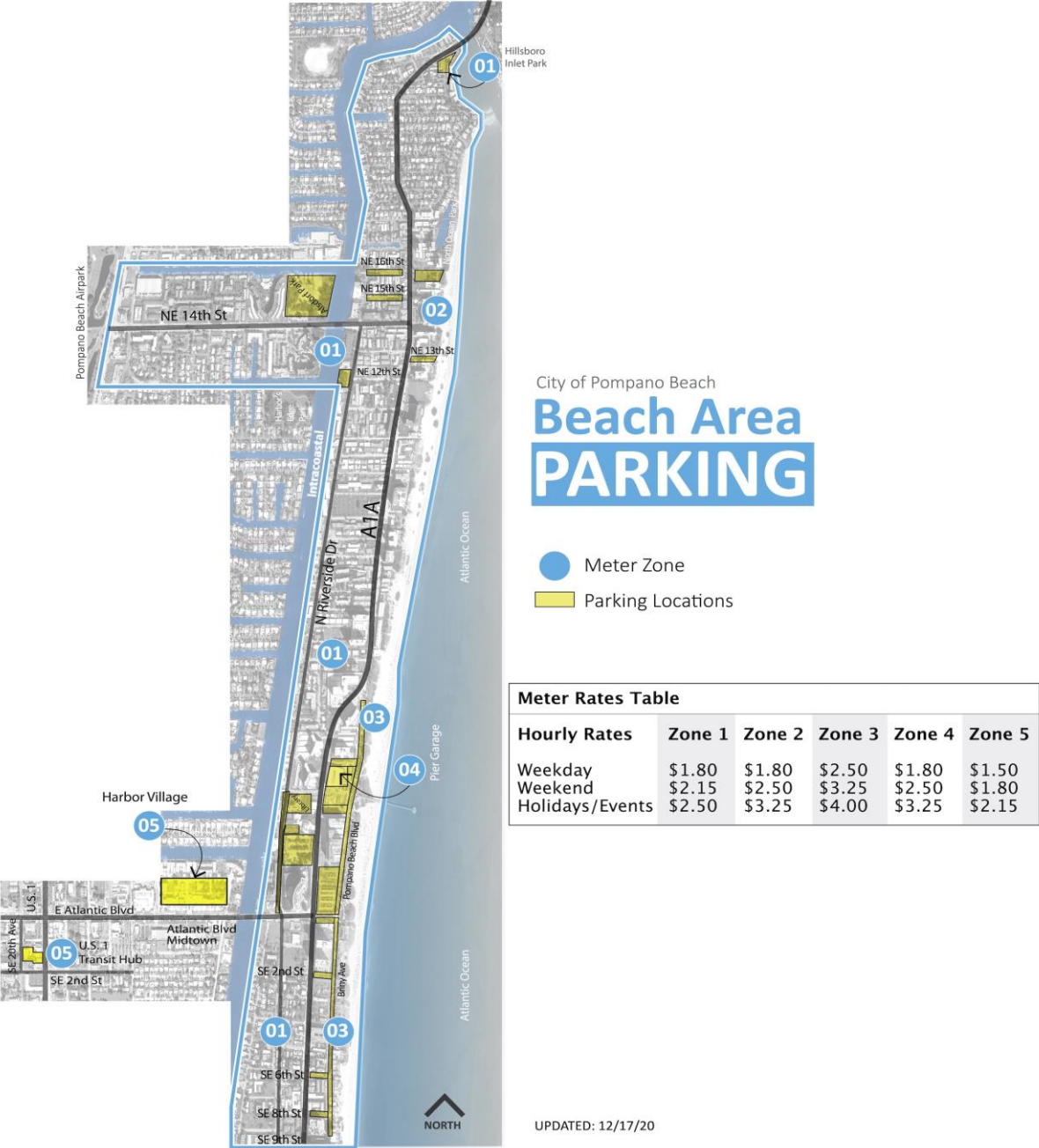
EXHIBIT B PARKING METER ZONE LOCATION MAP