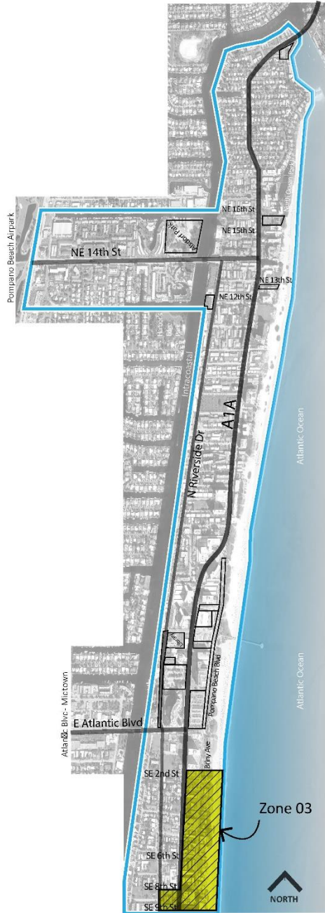
EXHIBIT A RESIDENT ANNUAL PARKING PERMIT DECAL LOCATION MAP