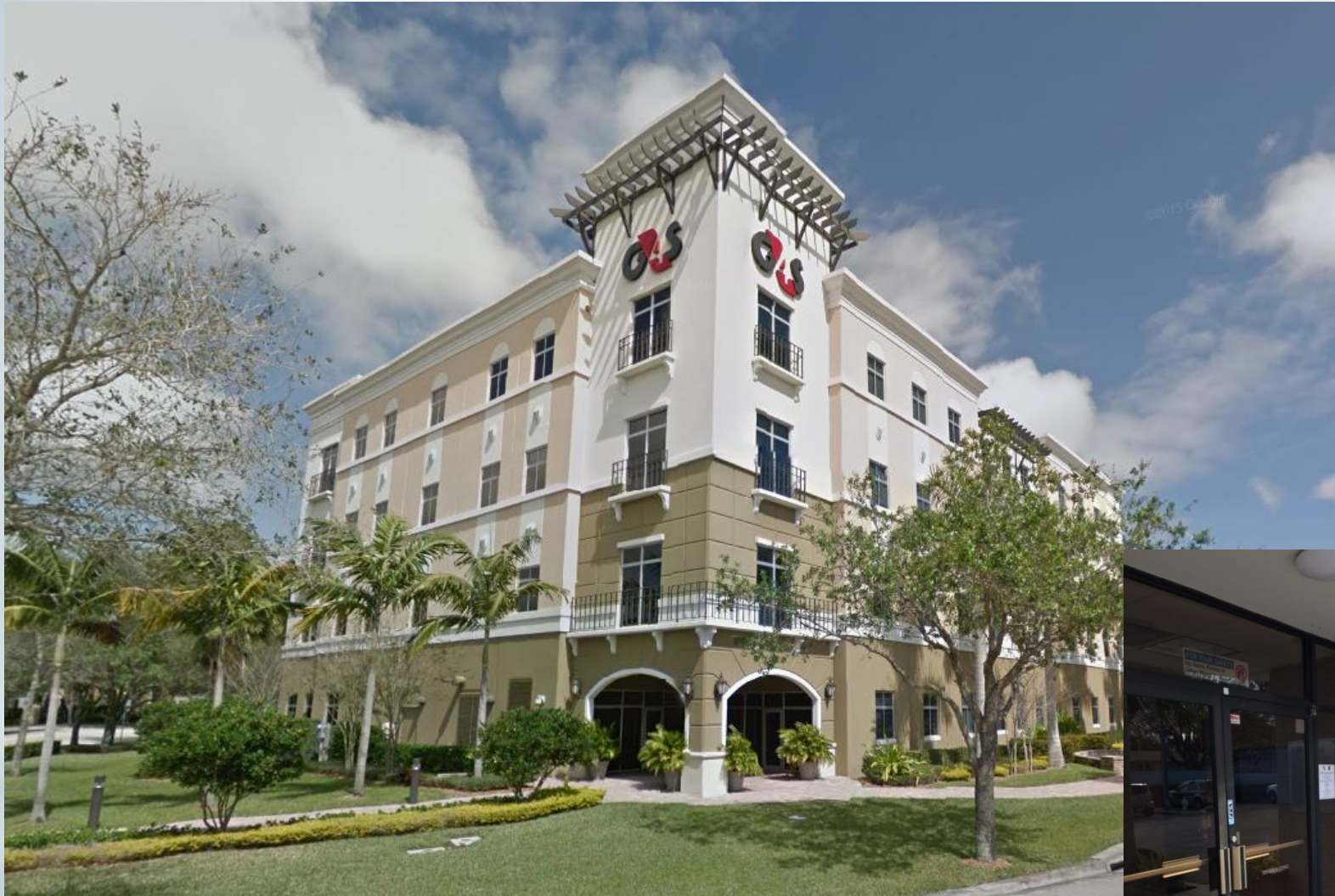
G4S - 1395 University Boulevard