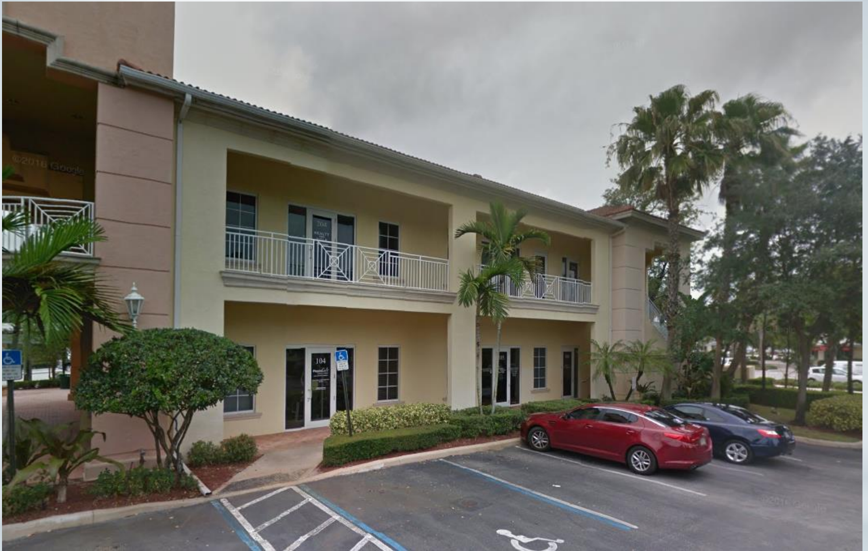
Pebworth Professional Plaza - 125 W. Indiantown Road

No lobby and open air walkways on second floor