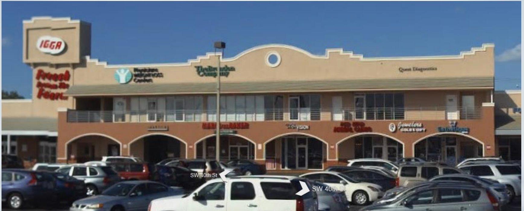
Redbird Center, Miami

Signs on upper floors- Can lead to sign clutter.