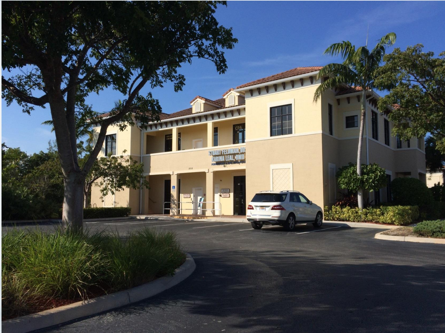
River Place - 1009 W. Indiantown Road

Concern raised by second floor tenants that they don't have signage on buildings