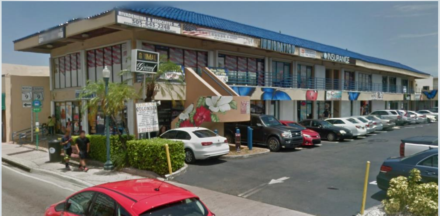
Miami, Florida – 2738 Tamiami Trail