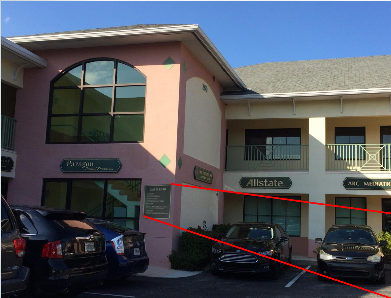
Jupiter Gardens - 350 Central Boulevard

(1) Photoshop of a directory sign added to indicate route to 2 nd floor tenants