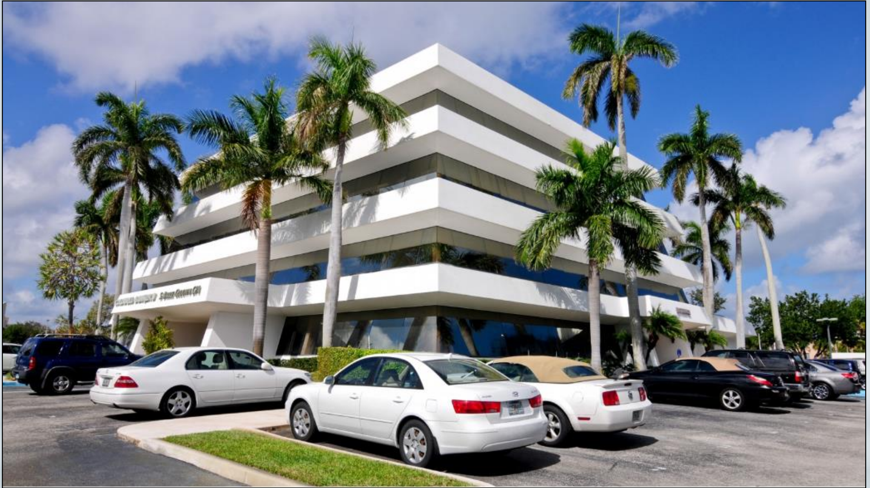
Reynolds Plaza - 1061 E Indiantown Road

(4) Stay the course – No changes to Town Code (window signs, wayfinding signs, branding of properties).